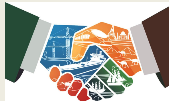
the Belt and Road Initiative

1. We believe that peace and development is the m_____ [填空1] (主流) of the world.